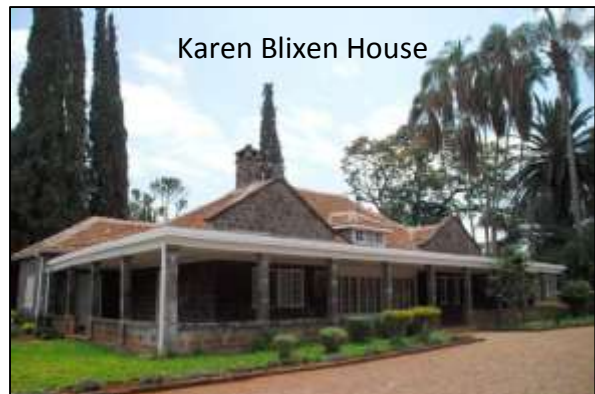
Karen Blixen House