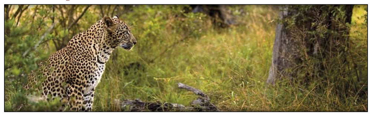
August 25-27 (Mon-Wed) – Lion Sand Private Game Reserve, Sabi Sand, South Africa – Lion Sands River Lodge

At 3:30 PM you gather for high tea before departing for another game drive. As the sun begins to approach the western horizon, we suggest you ask your guide to position your vehicle so you may capture the classic photograph of the dramatic African sun setting behind an iconic tree. Then, as darkness surrounds you, your tracker wields a portable spotlight, searching for the reflected eye-shine of nocturnal creatures seldom seen in the daylight hours. You return to camp in time to shower before you enjoy dinner under the African stars. (BLD)