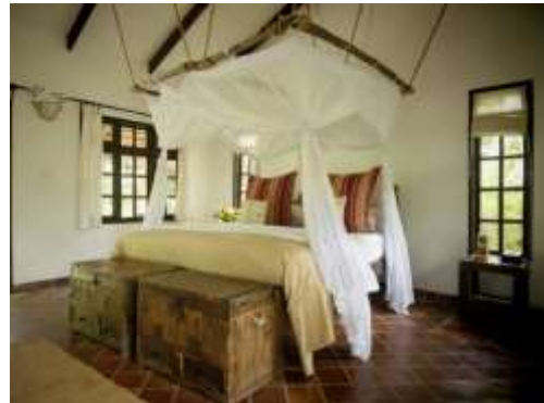
RIVERTREES COUNTRY INN