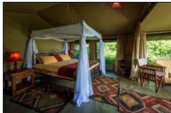
LIONS PAW CAMP